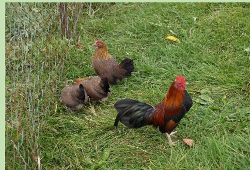
Black Breasted Red Old English Game