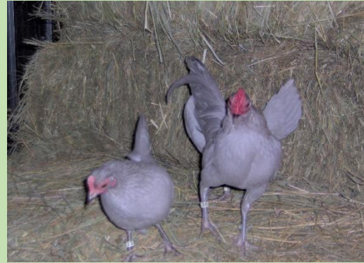
Self-Blue Old English Game

Varieties: Black Breasted Red, Silver Duckwing, Gold Duckwing, Red Pyle, Silver Blue, Self Blue, Blue, Lemon Blue, Black, Crele, Pearl, Wheaten, Fawn Silver, Porcelain, Spangled, Mottled, Mille Fleur and Brown Red.