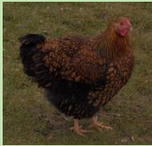
Golden Laced Wyandotte hen

Varieties: Golden Laced, Silver Laced, Partridge, Columbian, White and Buff.