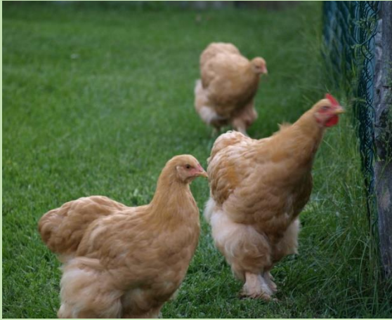
Young Buff Cochins

Straight run chicks: [5.00 for 5-10] [4.80 for 11-25] [4.65 for 26-50]